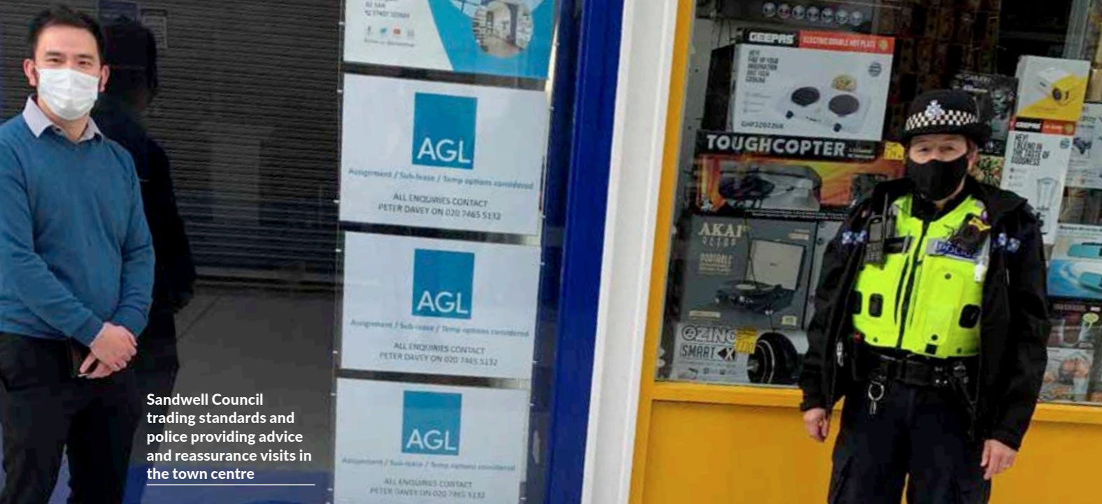
Sandwell Council trading standards and police providing advice and reassurance visits in the town centre